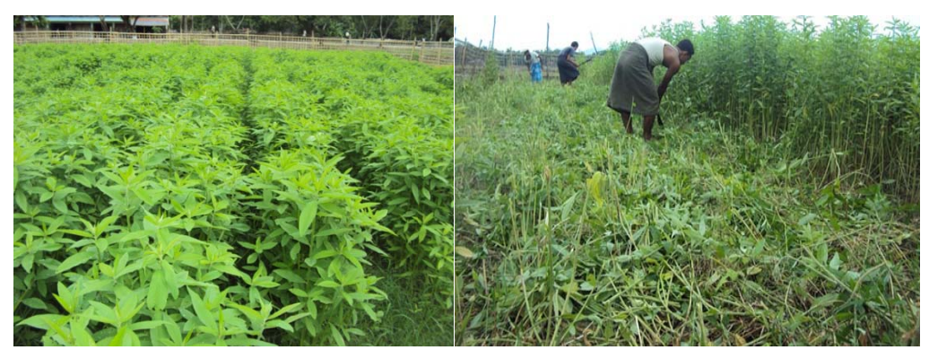
Green manure planting and cutting down before paddy

Crotalaria juncea is a fast growing green manure plant that can fix N as high as 120 kg/ha in 50 days. It was grown in 1 feet row spacing with a seed rate of 12 kg/ha on 21May.