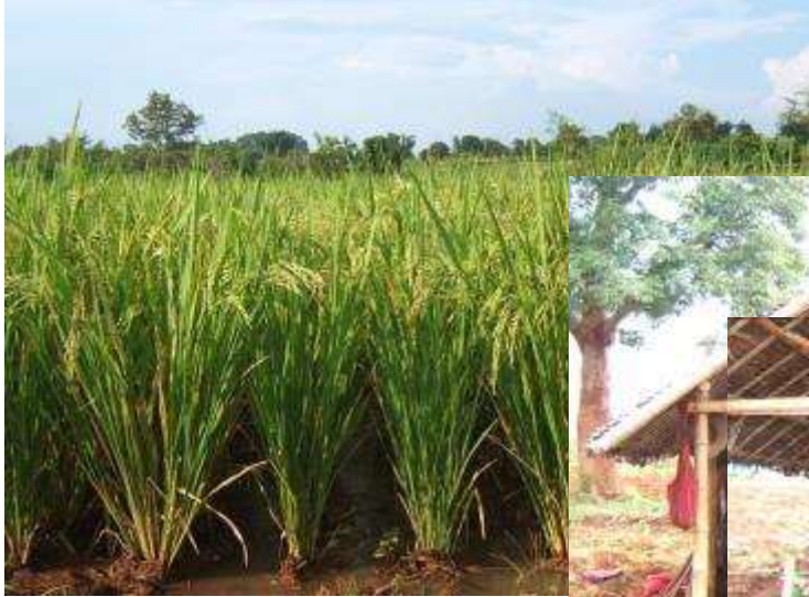
Study Plot (Rice)