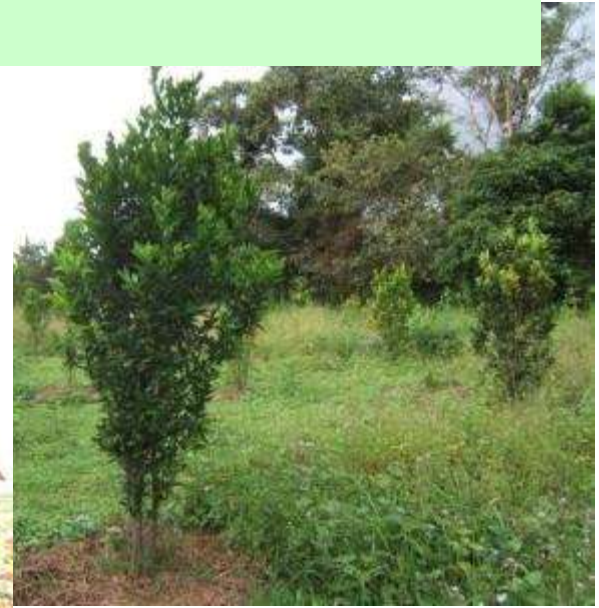
Long Term Crop