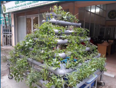
Initial system (July 2017)