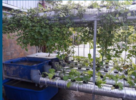
Adapted system (Nov 2017), by water & siphons