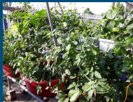
Adapted system (since Sept, 2017), with sediment tanks and siphons