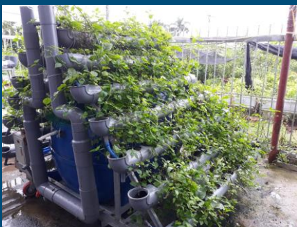
Initial system, compacted (on-going)