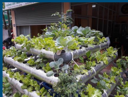
Adapted system (Nov 2017), operated by siphons