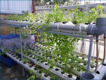
Initial system, by earth worm (July 2017): FAILED