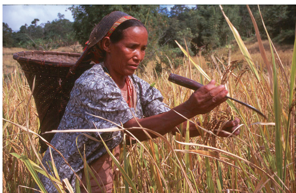
PLATE 4: An Angami shifting cultivator deftly harvests her swidden rice and deposits it in the basket on her back.

With your collective wide experience in this field, I suspect that there must be some really interesting shots amongst your personal photo archives, and we'd love to include a few of them in this next volume! I emphasize that we are extremely careful in making sure that the contributing photographer is properly accredited! If any of your photos are selected for publication, then we will get back to you later to seek your help in developing an appropriate caption to accompany it.